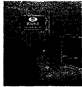
After New Proposed Signage