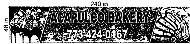
NEW proposed graphic (only)