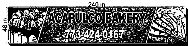
5 in thick