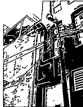
Vent Ducts SCALE N.T.S.