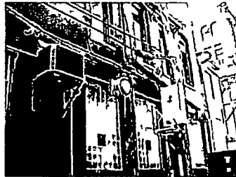
3 Vent Ducts SCALE N.T.S.