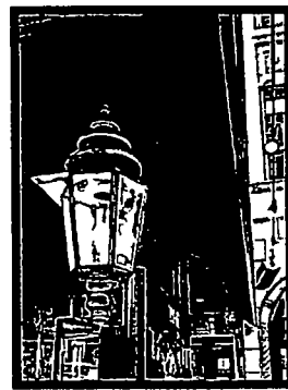
STREET ENTRANCE EAST SIDE LIGHT