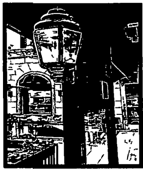
STREET ENTRANCE WEST SIDE LIGHT