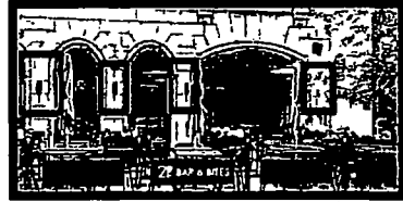
EXTERIOR LIGHT EAST SIDE OF THE HOTEL ENTRANCE (4)