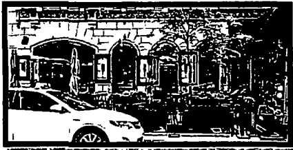
EXTERIOR LIGHTS WEST SIDE OF THE HOTEL ENTRANCE (4)