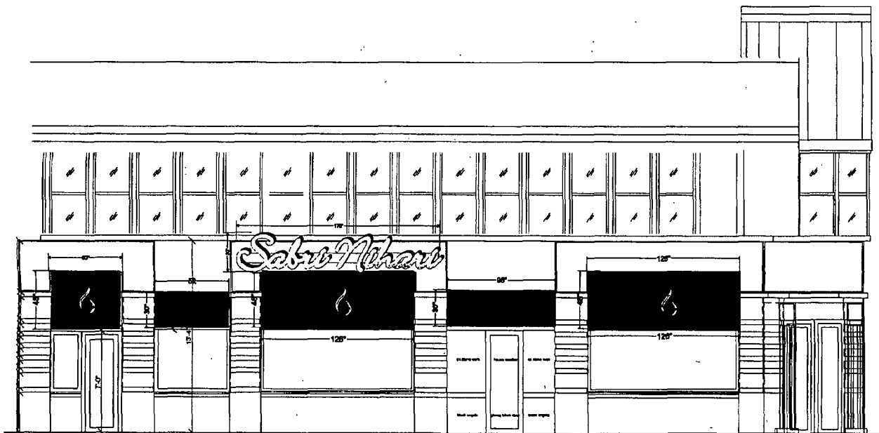
ELEVATION ON DEVON AVENUE

EXPRESS SIGNS & Graphics Inc. Window Signs & Retail Interior / Exterior Signage www.neonexpress.net 1-888-2NEONEX 5028 N. Broadway, Chicago, IL 60640