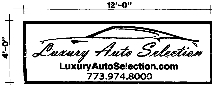
4'x 12' SINGLE FACE WALL SIGN