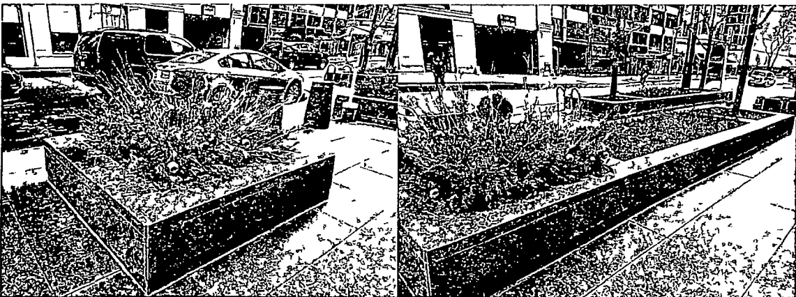
Northeast Delaware Planter 14