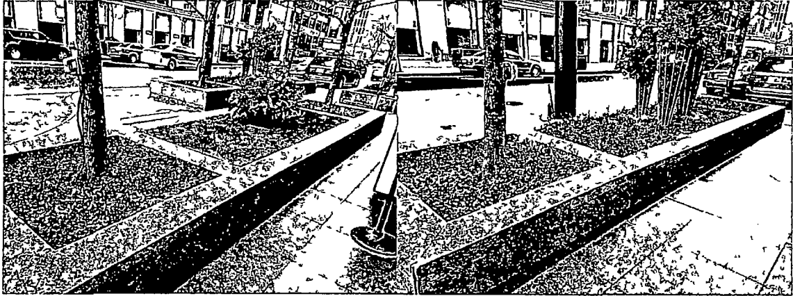
North Center Delaware Planter 10