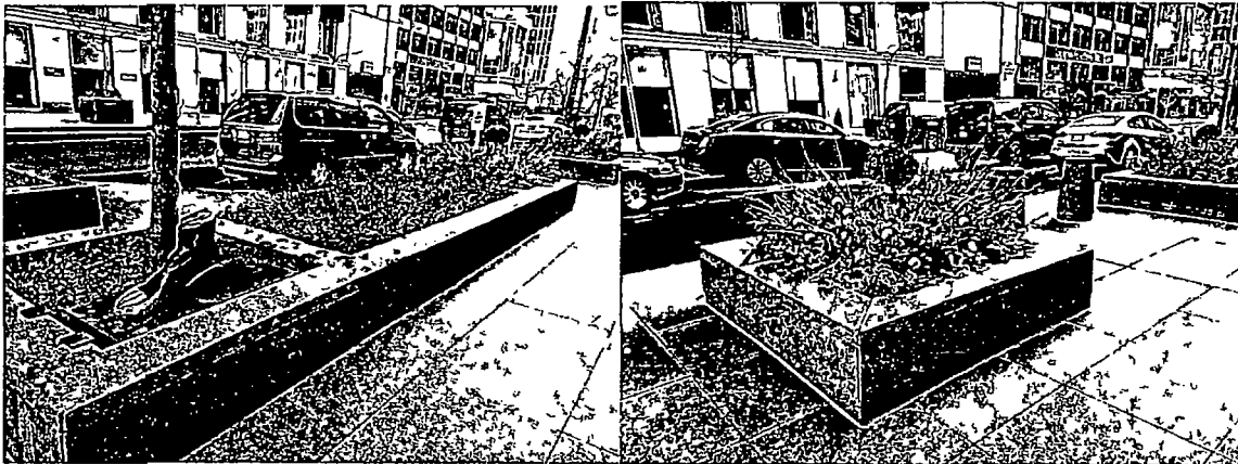
Northeast Delaware Planter 12