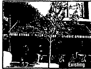
True Brown Sunbrella awning fabric attached with matching trim Awning valance decorated w/ heat transferred graphics to match 3M #7725 99 Fawn 1" thick stripes are spaced 3" from bottom of valance