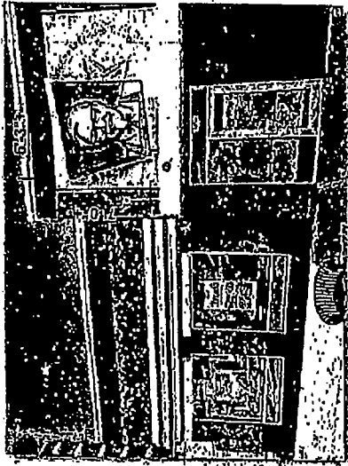
West Building Elevation -