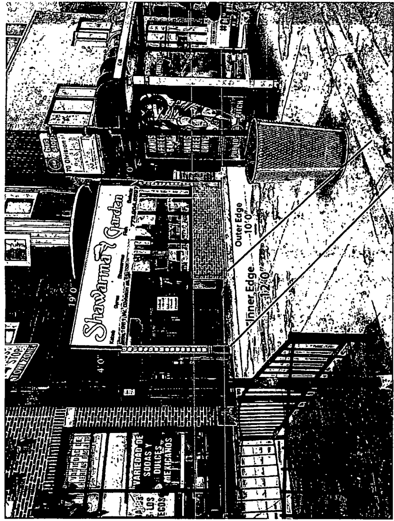
NOTE: Photo for representational purposes only. Signs are not to scale and may appear larger or smaller than shown.