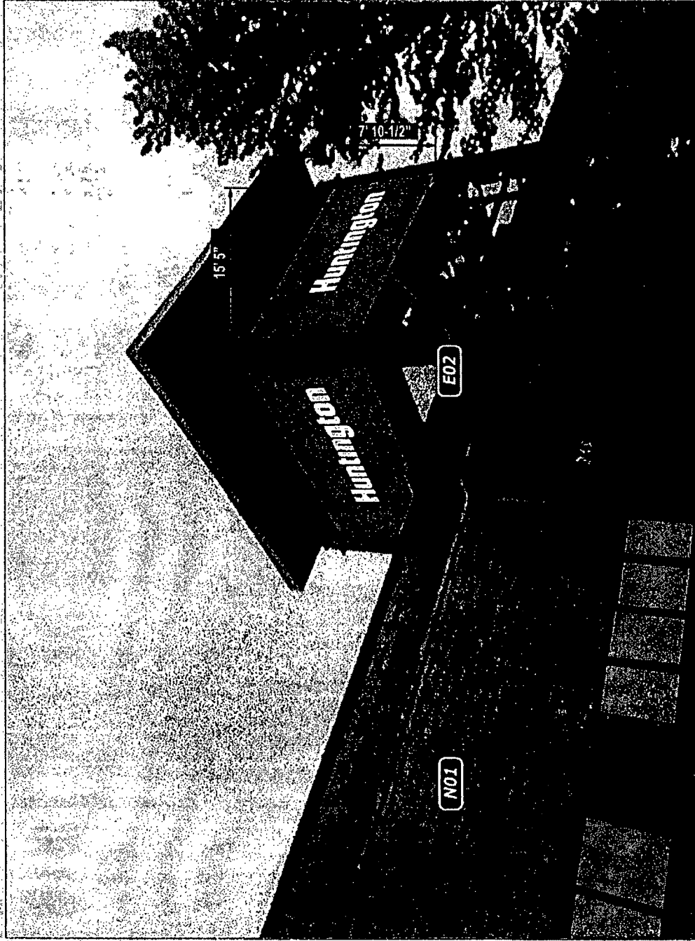
Signs Rendered Proportional to the Photo