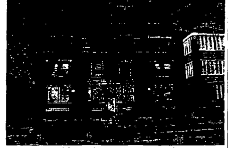
EAST ELEVATION - FENCING S. VERNON