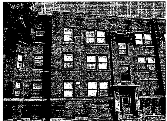
SOUTH ELEVATION - ENTRY STEP / BLDG PROJECTION E. 62ND ST

LANDON BONE BAKER 734 N Milwaukee Avenue Chicago IL 60642 p 312-988-9100 f 312-829-3302 www.landonbonebaker.com