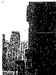
1 OF 2 EXISTING SIGNS