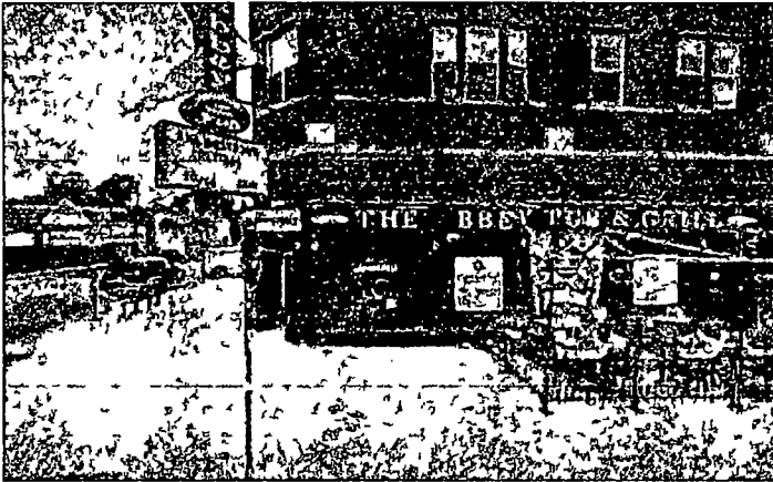
3420 W Grace St Chicago IL 60618