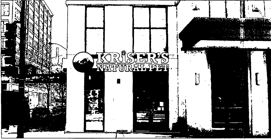
LED FACE LIT CHANNEL LETTERS ATTACHED TO EXISTING RACEWAY