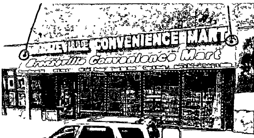
BEFORE AND AFTER PRE-EXISTING AWNING AND SIGN