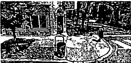
Currently shown Jun 2018