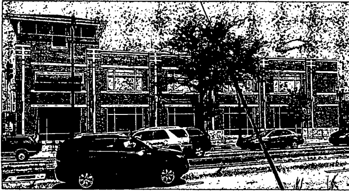
95 th Street