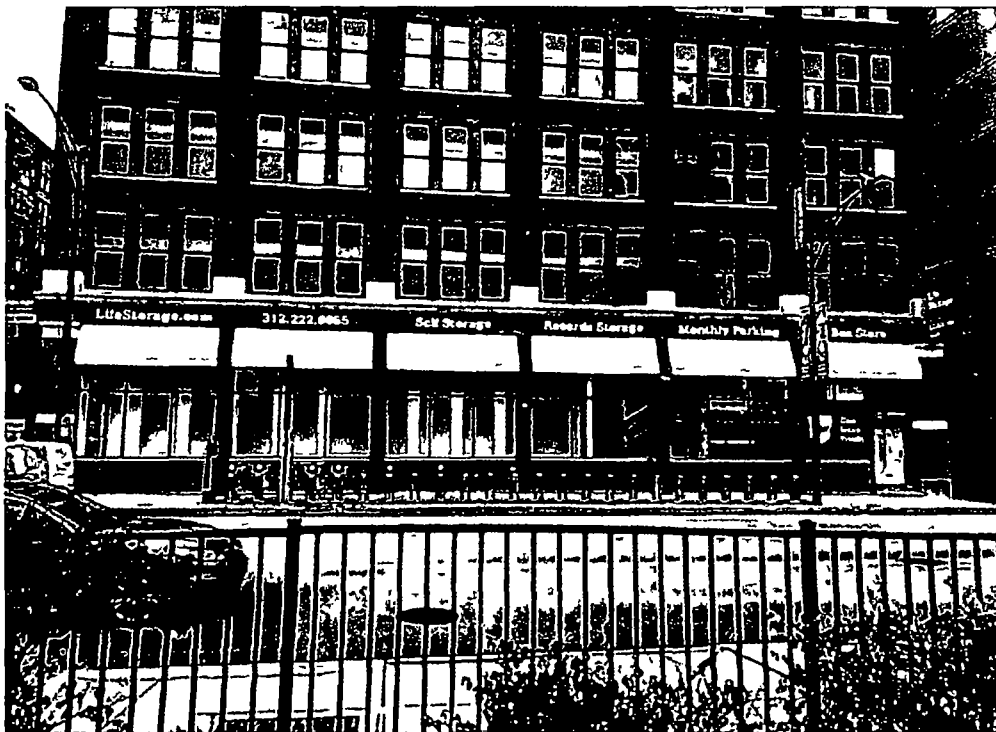
Awnings along Orleans Avenue