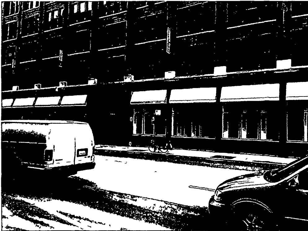
Awnings along Ohio Street