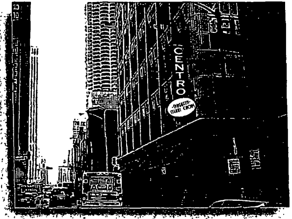
NORTH ELEVATION FACING NORTH & SOUTH ON STATE ST.