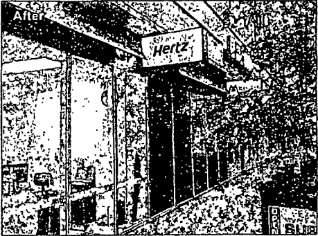
Existing Sign: 2'-0 1/4" tall x 4'-0 1/4" Wide