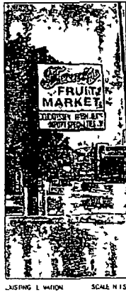
JUSFNG L VATION SCALE 1/8

SQUARE FOOTAGE 94.04 ALLOWABLE SQUARE FOOTAGE N/A