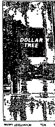
RECPY ED ELCHILLIN SCALE 1/8