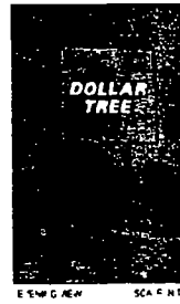
FRONT VIEW SCALE 1/8