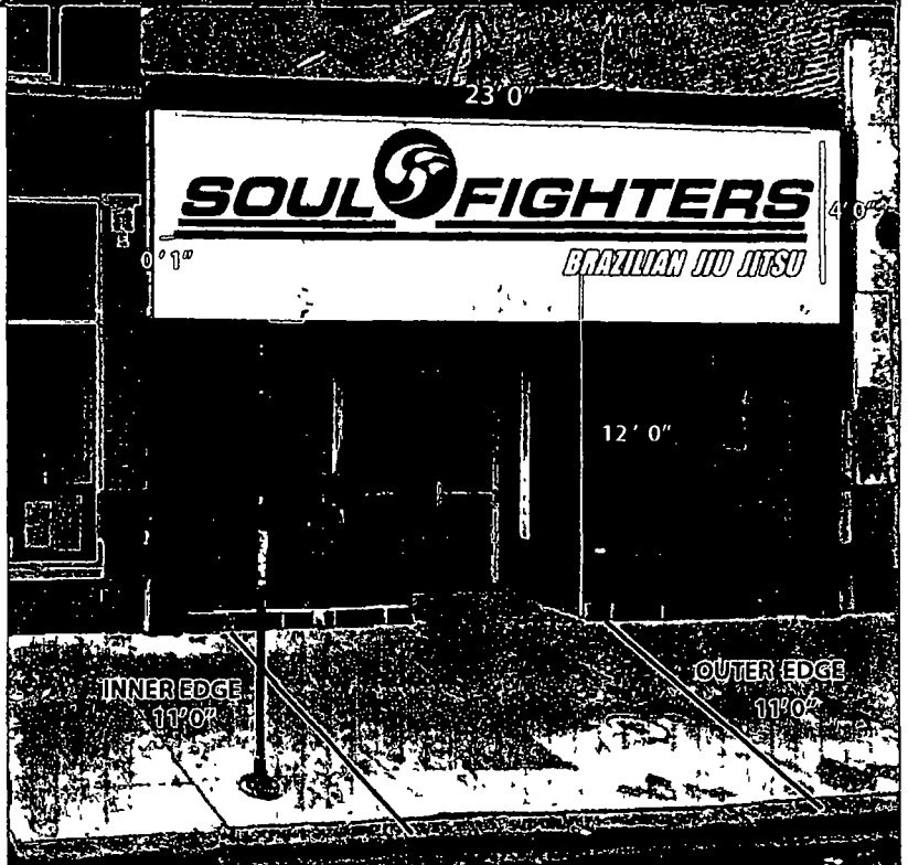
NOTE: Photo for representational purposes only. Signs are not to scale and may appear larger or smaller than shown.