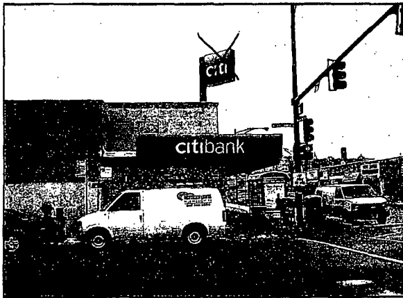
EXISTING 3'-0" x 20'-0" SIGN BOX.