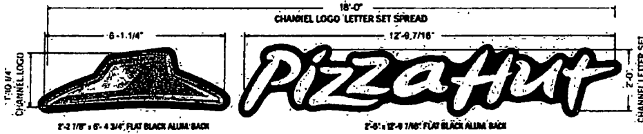
FRONT VIEW @ PAN CHANNEL LOGO & LETTERS ON FLAT BACK PANEL

NOTE: LETTERS ARE INDIVIDUALLY LIT, BLOCK LETTERS