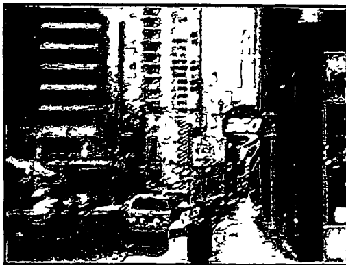
EXISTING (48" ILLUMINATED BLADE SIGN)