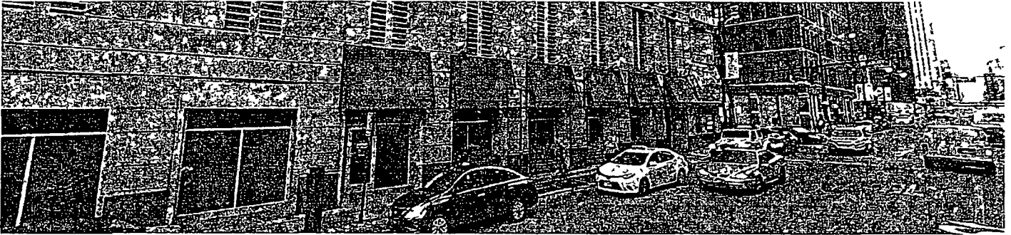
Street Views of Site -

© 2018 Olympic Signs Inc. All rights reserved. No part of this document may be reproduced without written permission.