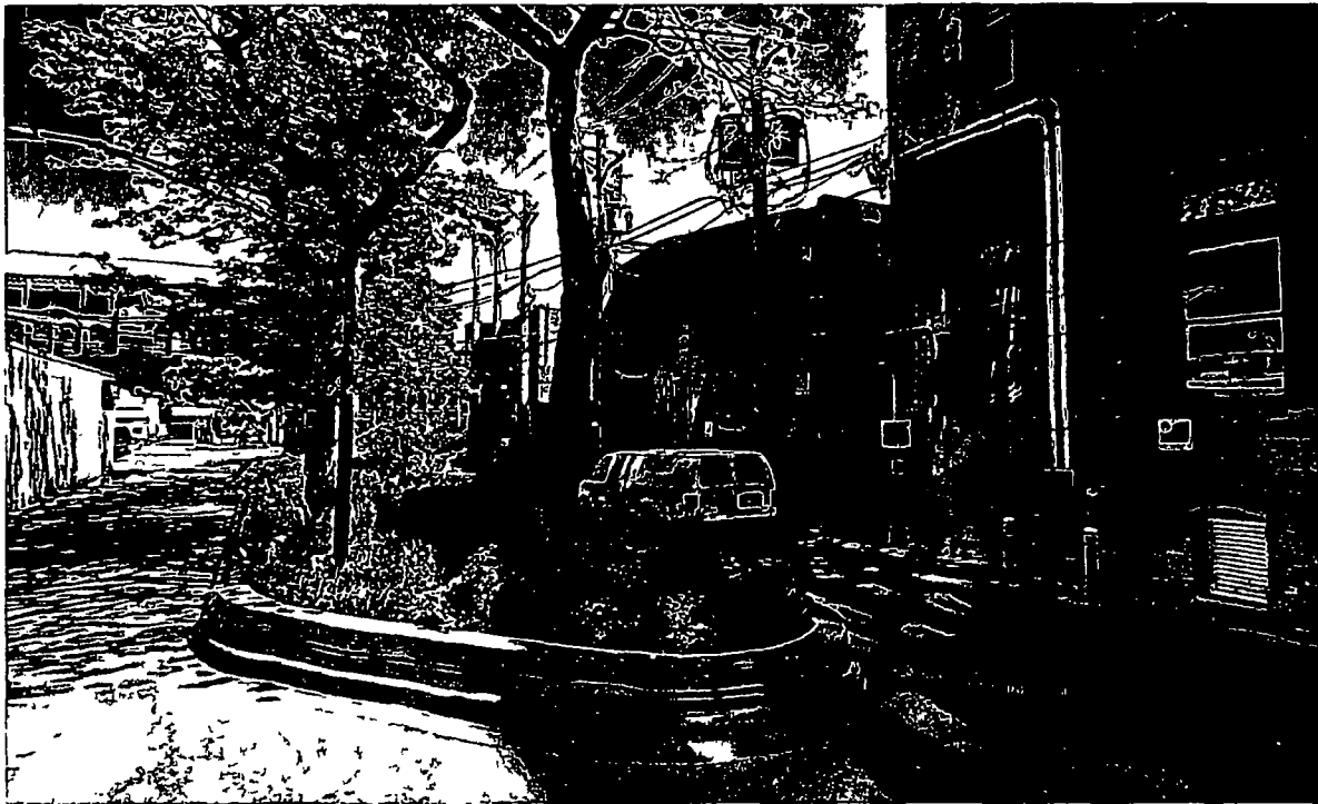
N Sandburg Terrace (Looking North)