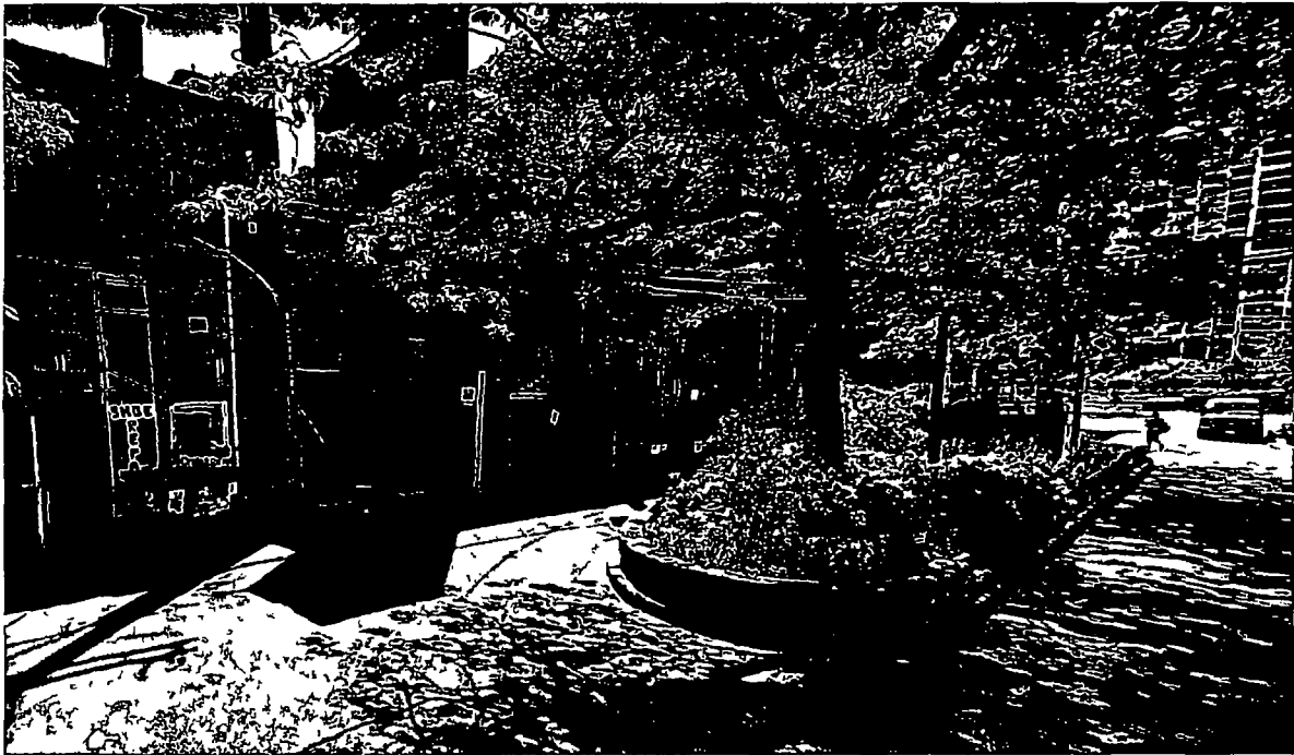
N Sandburg Terrace (Looking South)