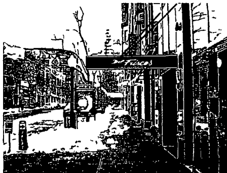
View from street level - FEBRUARY 2015