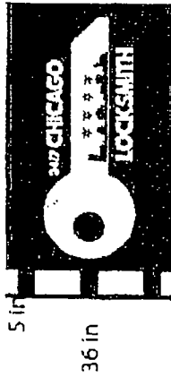
Push Through Sign Cabinet