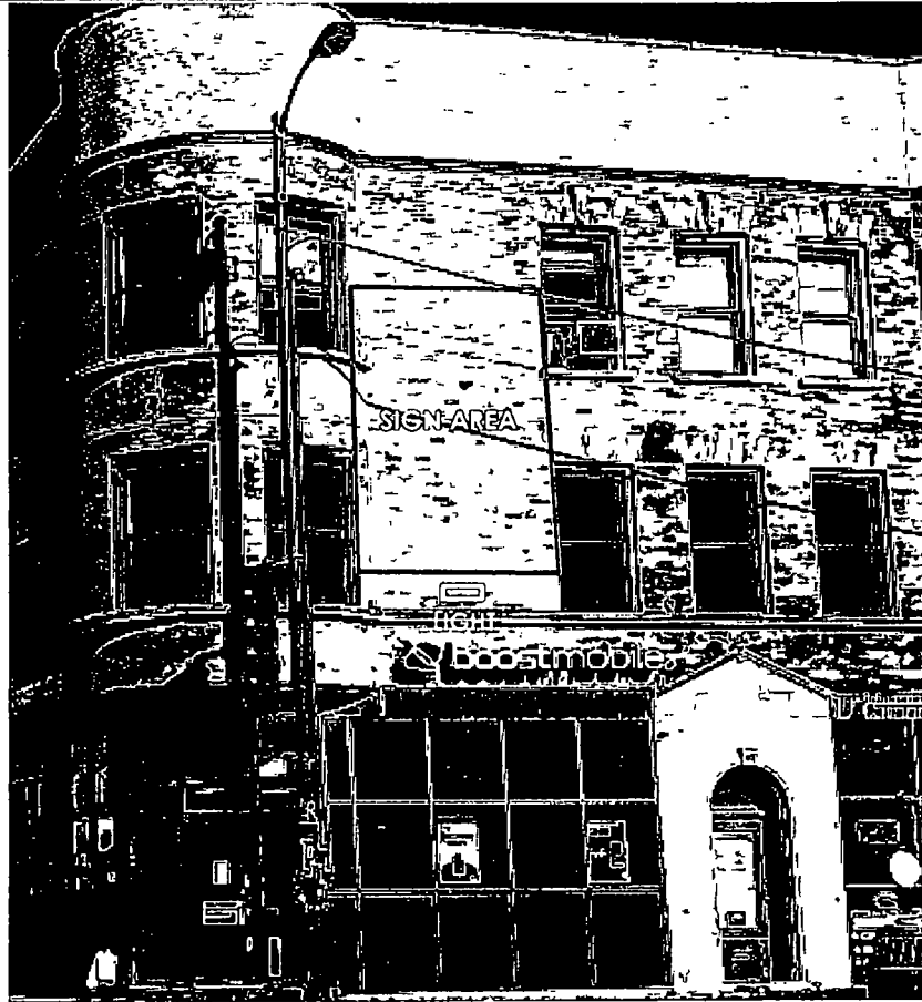
South Wall Depicting Sign & Light

Property Address 2358 West Chicago Ave – Public Way Use – Sign PWU Permit #