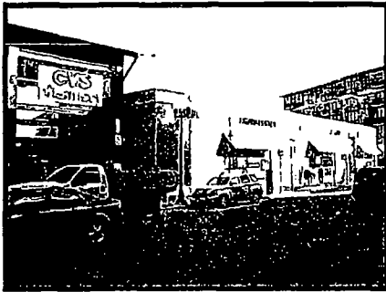
Existing Signage - West Elevation