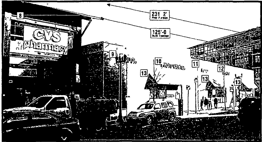
Proposed Signage West Elevation