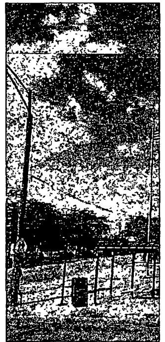
Northeast 51st Street