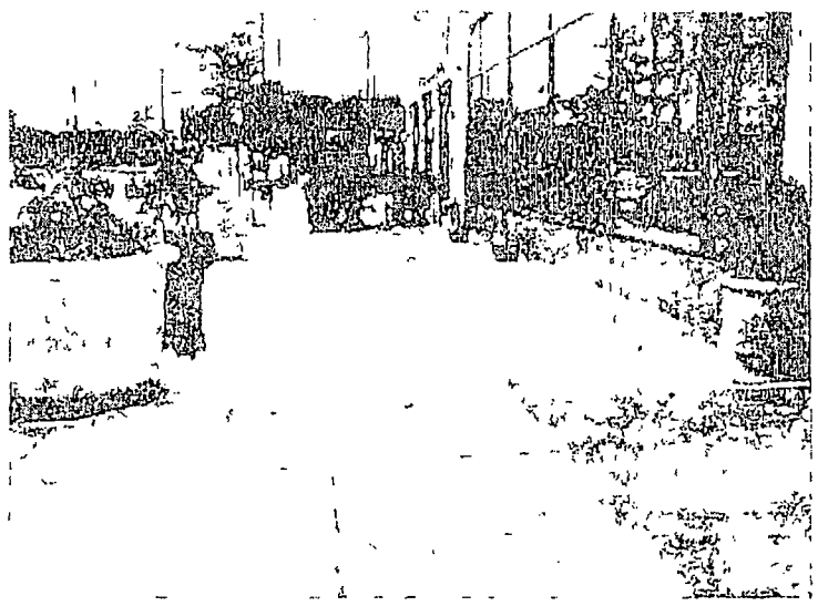
Side View Looking South