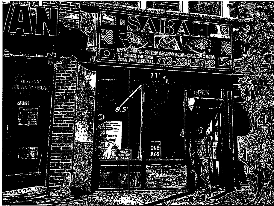
Detail of the sign