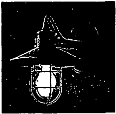
733 N LaSalle – Building Face