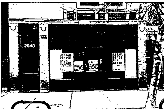
Existing Conditions NTS

All components are U.L. listed items, with installation conforming to U.L. standards