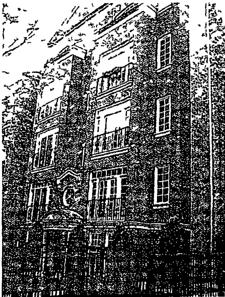
Front of the building