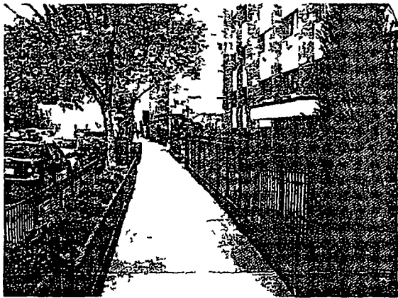
Sidewalk looking east to Clark street