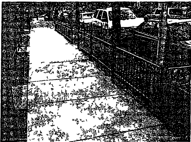
Wrightwood Plaza parkway fences