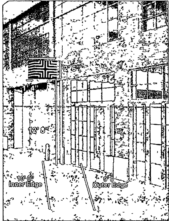
NOTE: Photo for representational purposes only. Signs are not to scale and may appear larger or smaller than shown.

Sign Erector PRO IMAGE 2006 W. Chicago, Ave. Chicago, IL 60622 Tel. 773 292 1111 Fax. 773 645 4169