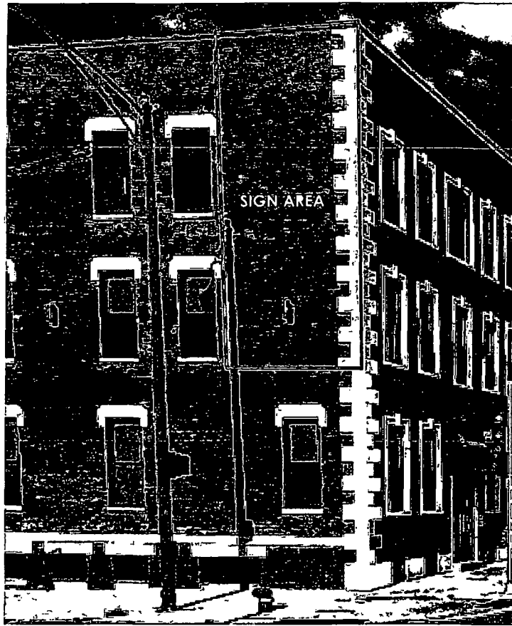
West Wall Depicting Sign

Property Address. 668-670 West Hubbard St – Public Way Use – Sign PWU Permit #: _____