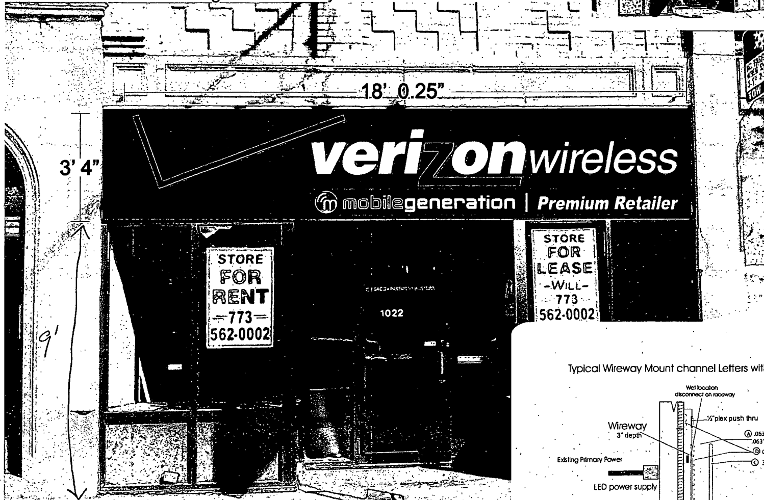
Typical Wireway Mount channel Letters with LED's