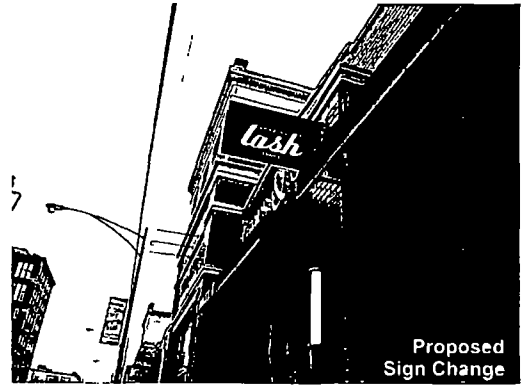
Proposed Sign Change