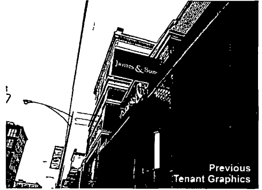
Previous Tenant Graphics