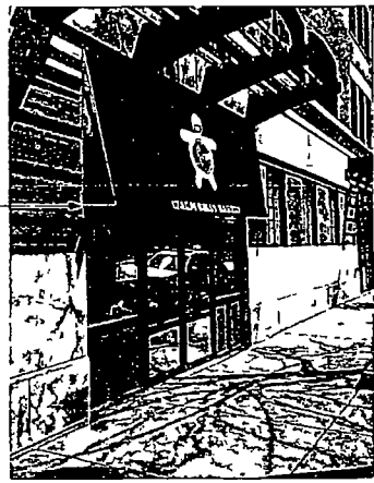
Southeast Elevation NTS