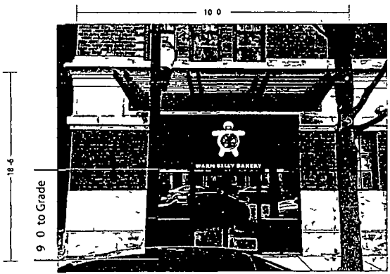
South Elevation NTS