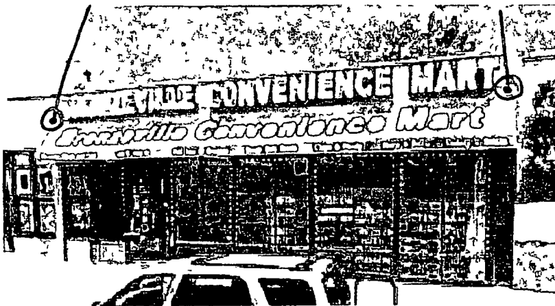
BEFORE AND AFTER PRE-EXISTING AWNING AND SIGN