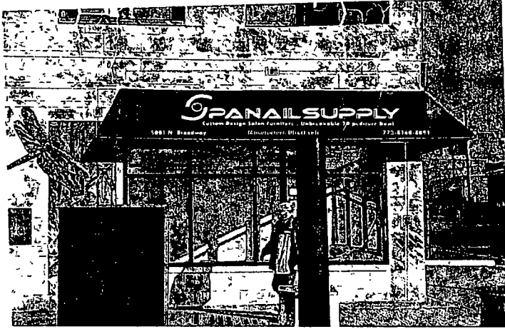
West side canopy