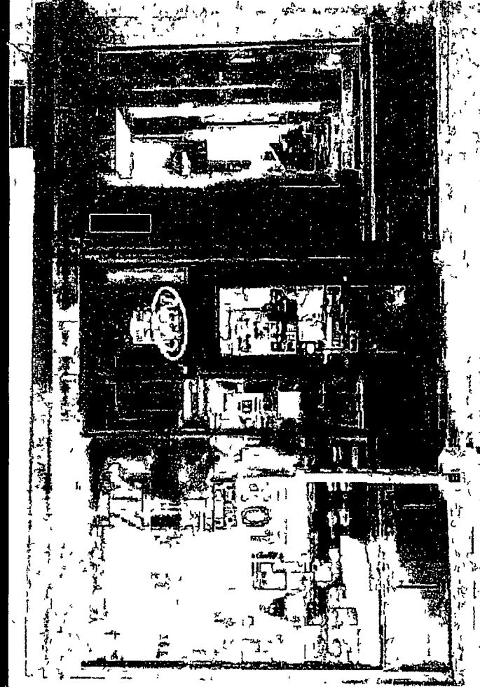
Van Buren St. Side