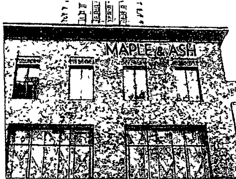
MAPLE ST. ELEVATION