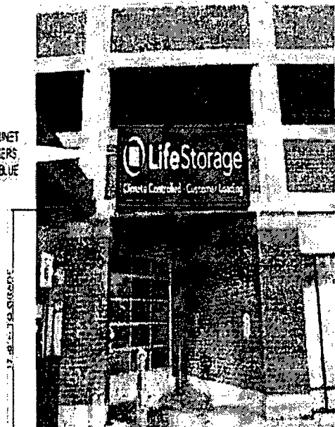
EXISTING WEST ELEVATION / NEW SIGN FACE

REPAINT CABINET & PETAHERS PMS #288 BLUE