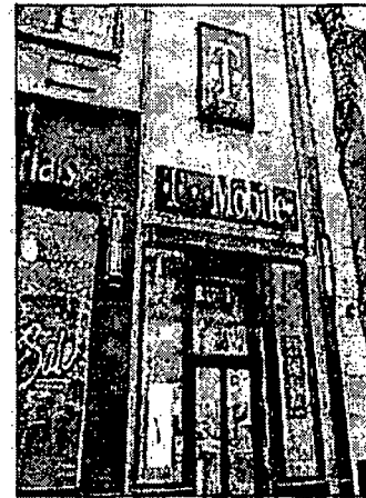
A9 EXTERIOR PHOTO